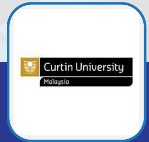
Curtin University, Malaysia