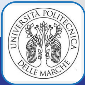
University Politecnica delle Marche, Italy