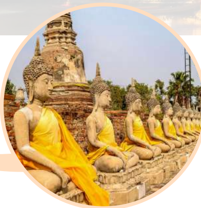
EASY ACCESS AND SAVINGS & ONE OF THE BEST HOTELS