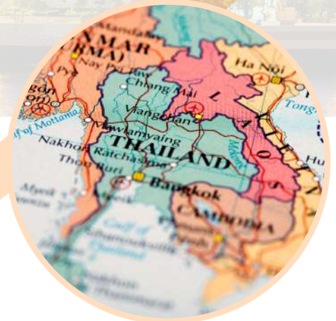
GUARANTEED BEST RATE

You can now easily reserve a room at Hotel Ambassador for the duration of the conference. Globeenjoy, the conference's official tour , and accommodation partner will assist you in making this more comfortable.